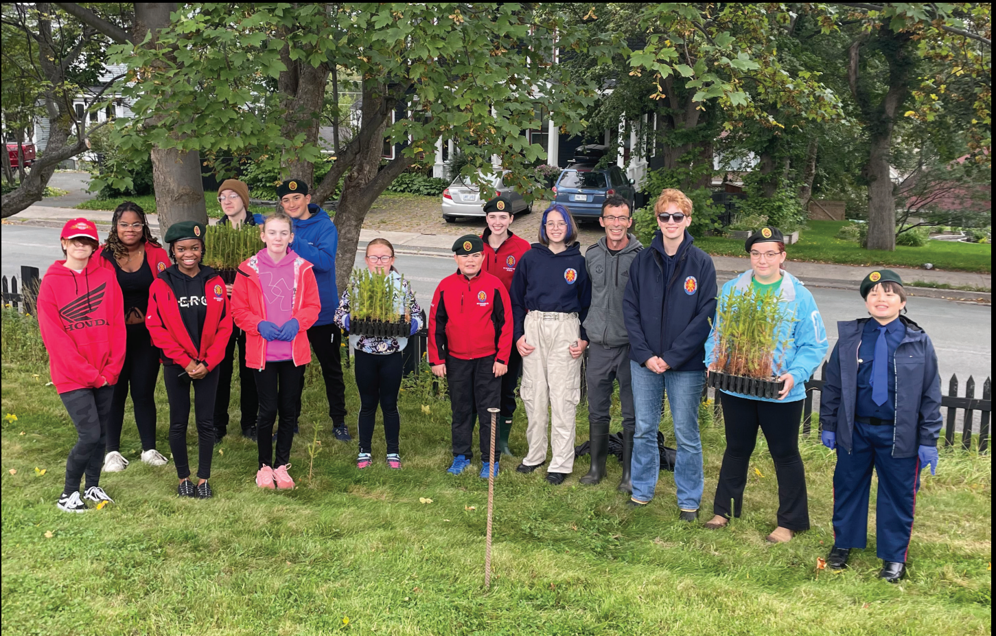
On the grounds of Government House, members of St. Michael's and St. Augustine's Companies, and members of our Regimental Band came together to help plant 130 trees for our 130th Anniversary.